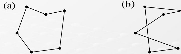
The TSP, showing a good (a) and a bad (b) solution to the same problem